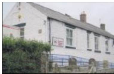
BACK FROM BRINK: Forest of Teesdale School was saved from closure five years ago after a community campaign